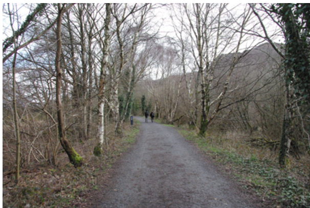
The Mawddach trail from the station park. Turn right off this path into the bog.

From the park leave on the waymarked Mawddach trail away from the bridge. After a short distance take the path right into Arthog Bog.