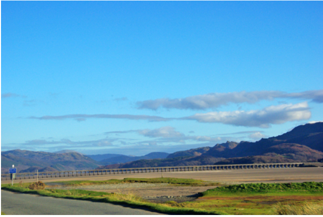
Part of the bridge seen from the “point” at Fairbourne.