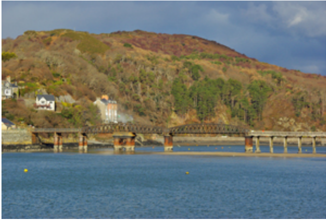
The metal double span of the railway bridge at the Barmouth end.