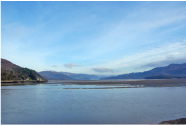
View from further along the bridge.