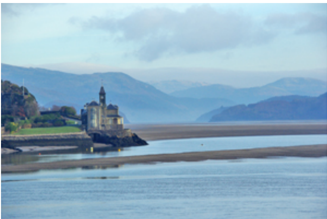
Closer view of the “clock tower” house.