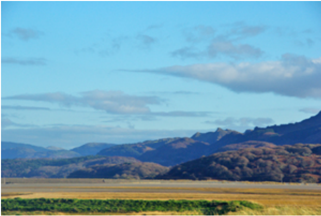
View eastwards over the Mawddach estuary.