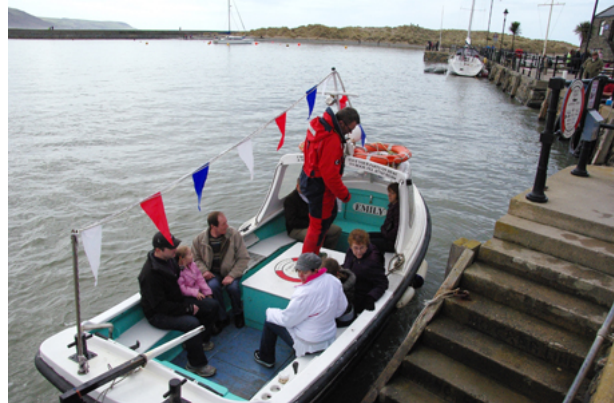
The ferry mooring at Barmouth quay.

You can get refreshments in Barmouth or, on the Fairbourne side, at the station café at the “point”.