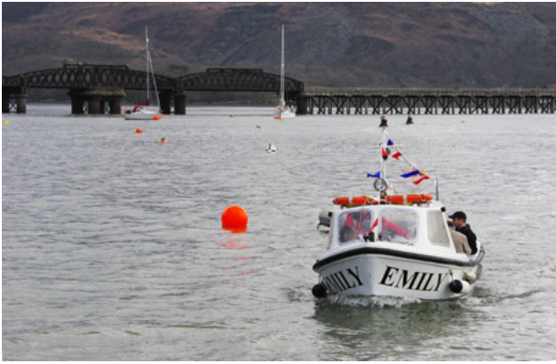
The ferry with the double arch of Barmouth bridge in the background.