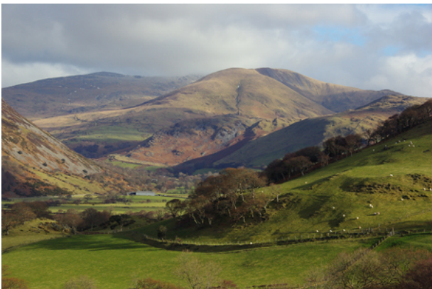
View towards Cader - shrouded in cloud.