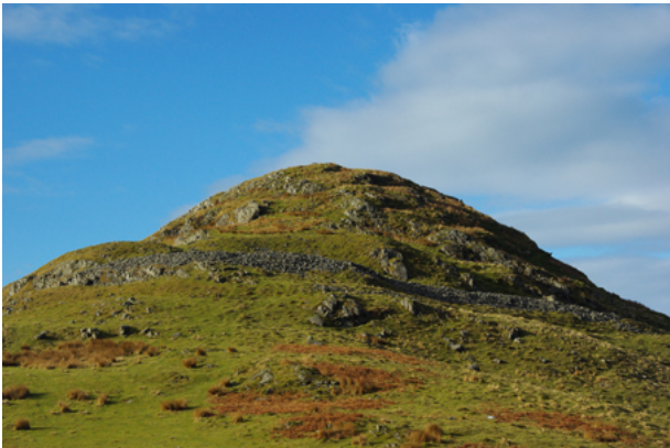
The top has a cairn. Please stay close to this. You have already seen the cliffs from the road!! On the left is the view of the top when you are nearly there. Bird rock is so-called because it is a nesting place for cormorants.