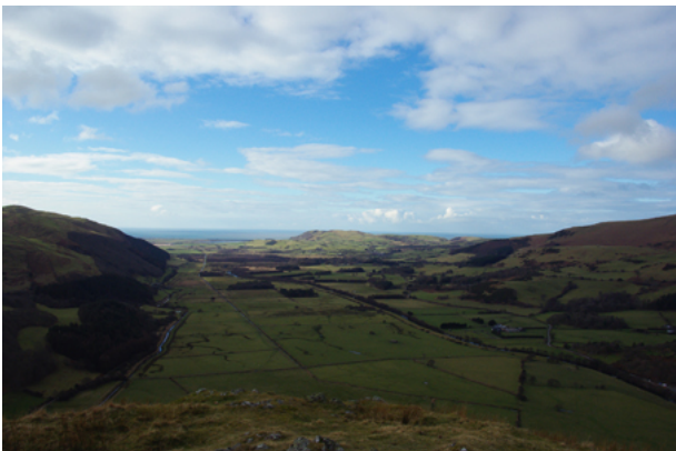
View from the top over the Dysynni estuary.