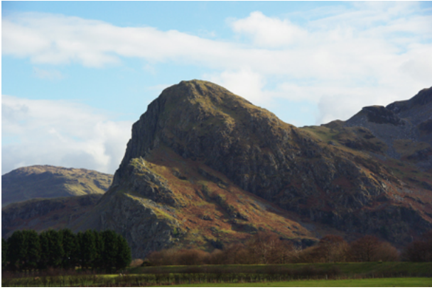
Bird rock seen from the road that approaches it.