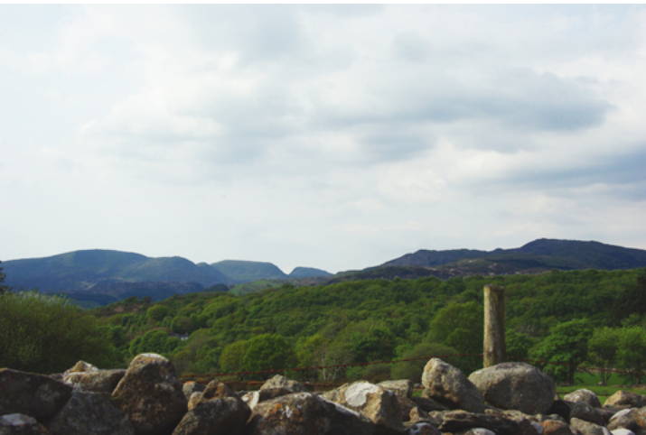
Diffwys and more hills on the Rhinog range seen from near Dolgellau.