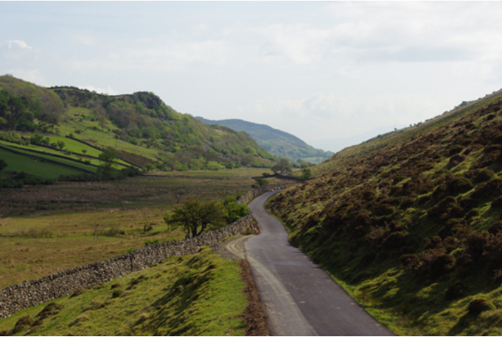
The onward route.