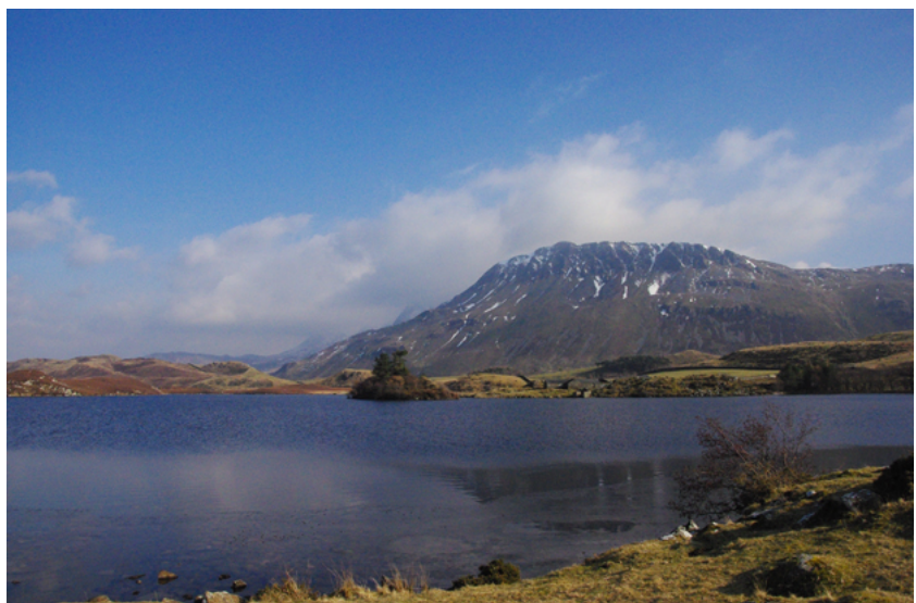
Creggenan lake with Tyrrau Mawr in the background.

Continue down to Dolgellau and from there take whatever route takes you home.