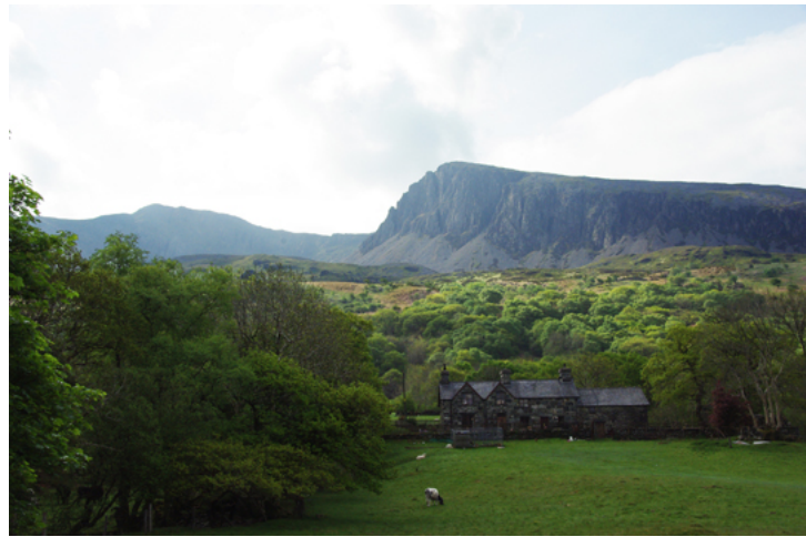
Cader from the road near Gwernan Lake.