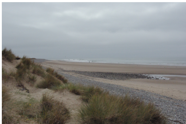
The northern beach backed by the dunes.