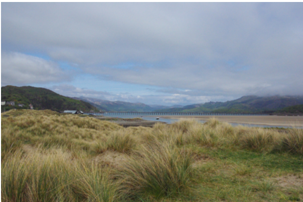
Looking inland from the dunes.