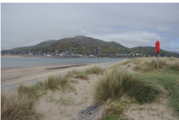
Looking across to Barmouth from the dunes.