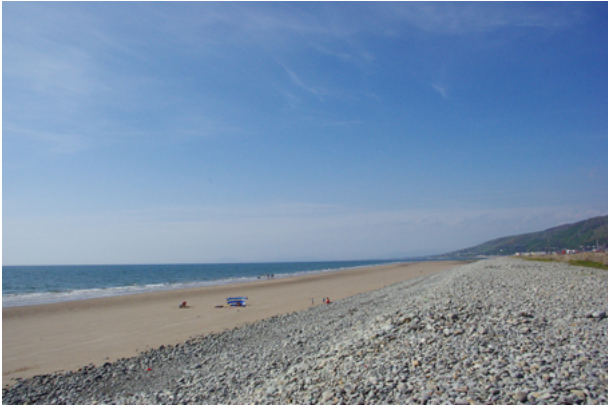
The beach looking towards Barmouth.