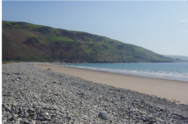
The beach looking southwards.