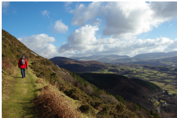
The grassy path beyond the wheelchair accessible path.