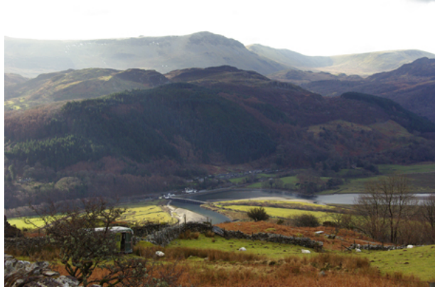
Looking down on the toll bridge and the George at Penmaenpool.