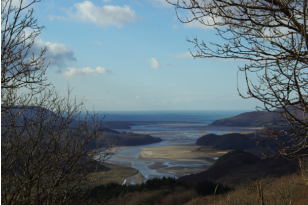
View looking seaward.

There are a number of way-marks near the house visible from the park. These are not very helpful. However it is simple to find the right way - just take the level path in front of the house and you will soon see a shale path marked as suitable for wheelchairs.