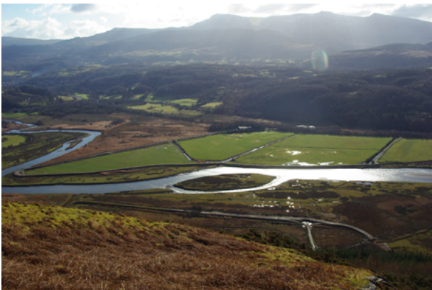
Looking down on the Mawddach with the Cader range in the background.