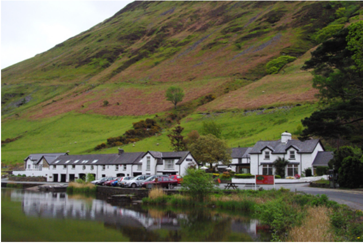
The Tyn-y-Cornel Hotel on the lake.