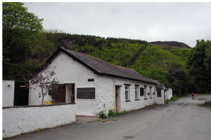
Pen-y-Bont pub and hotel. See Hostelries and Cafés.